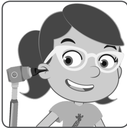
Doctors check your ears.