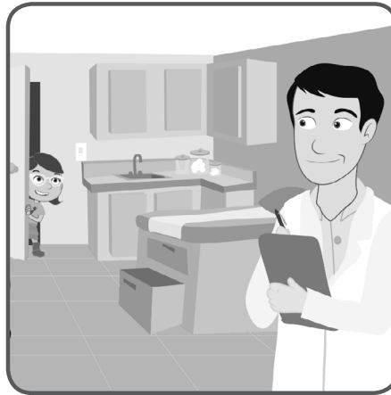
It is good to go to the doctor.