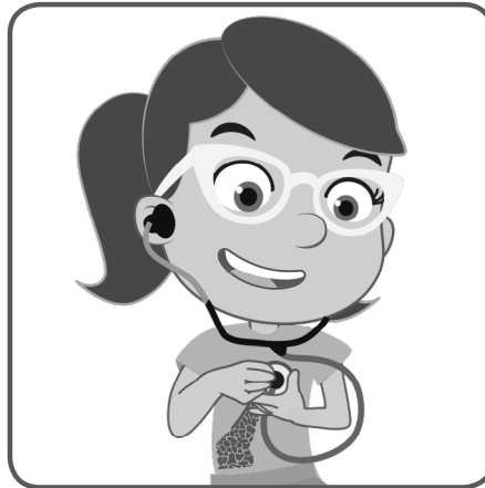
Doctors listen to your heart.